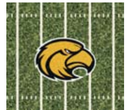
1392 Southern Miss End Zone Color: Black