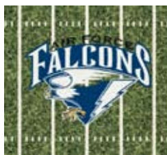
1008 Falcon End Zone Color: Blue