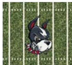
1047 BU End Zone Color: Red