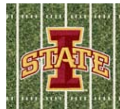
1111 Cyclones End Zone Color: Blue