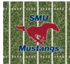
1390 Stangs End Zone Color: Red