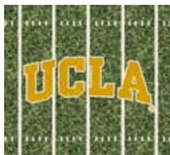
1457 Bruins End Zone Color: Blue