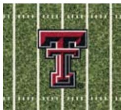
1440 Raiders End Zone Color: Red