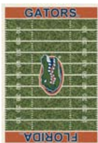
Size: 267 5'5" x 7'6"