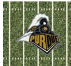
1345 Boilers End Zone Color: Gold