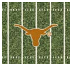
1410 Horns End Zone Color: Orange