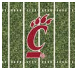
1049 Bearcat End Zone Color: Red