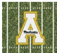
1014 Devil End Zone Color: Red