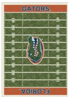
Size: 202 7'8" x 10'9"