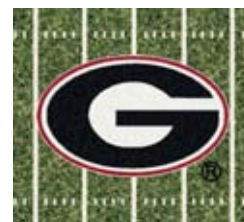
1080 Dawgs End Zone Color: Black