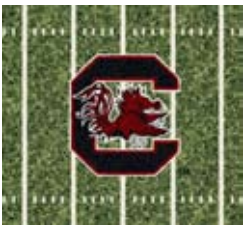
1350 Cocks End Zone Color: Red