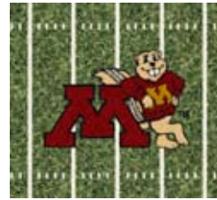
1185 Gophers End Zone Color: Red