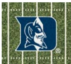
1512 Devils End Zone Color: Blue