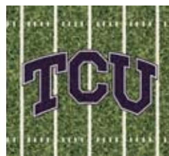
1430 Frogs End Zone Color: Purple