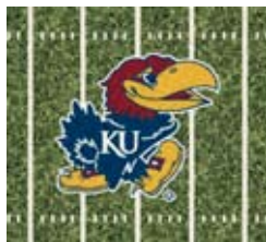
1120 Jayhawk End Zone Color: Blue