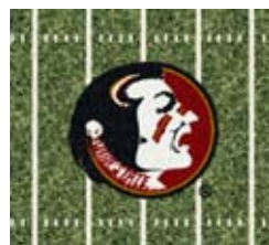
1514 Noles End Zone Color: Red