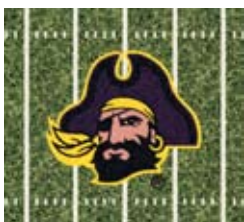
1068 Pirates End Zone Color: Blue