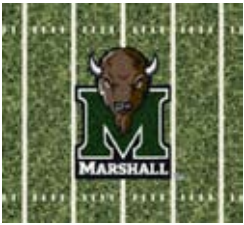
1153 Marshall End Zone Color: Green