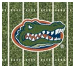
1500 Gator II End Zone Color: Orange