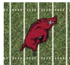
1020 Hogs End Zone Color: Red