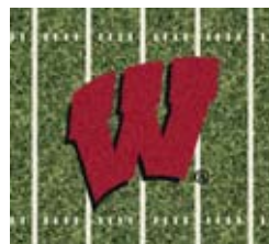
1490 Bucky End Zone Color: Red