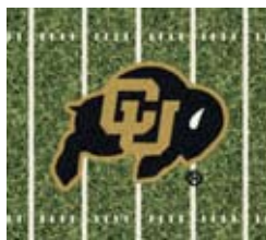
1063 Buffs End Zone Color: Black