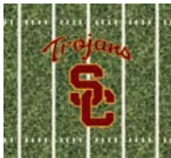
1370 Trojans End Zone Color: Red