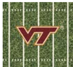
1460 Hokies End Zone Color: Red