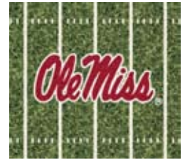
1186 Rebs End Zone Color: Blue