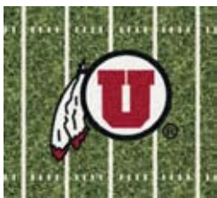
1452 Utes End Zone Color: Red