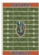
Size: 200 3'10" x 5'4"