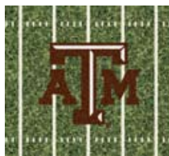
1420 Aggies End Zone Color: Red