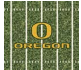
1292 Ducks End Zone Color: Green