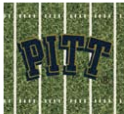
1330 Panther End Zone Color: Green