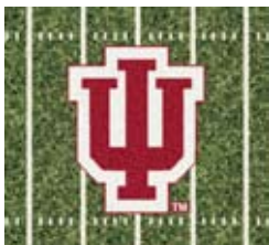
1115 Hoosier End Zone Color: Red