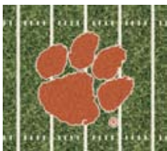
1050 Tiger End Zone Color: Orange