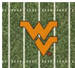
1470 WVU End Zone Color: Blue