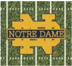
1260 Irish End Zone Color: Gold