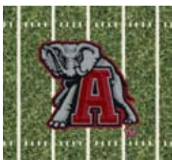
1010 Tide End Zone Color: Red