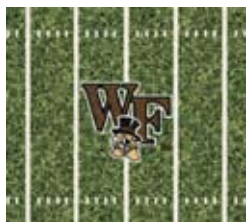
1462 Deacs End Zone Color: Black