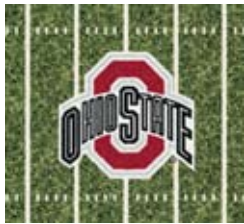
1000 BucLanes End Zone Color: Red