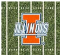
1113 Illini End Zone Color: Orange