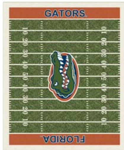
Size: 280 10'9" x 13'2"