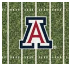
1012 Cat End Zone Color: Blue