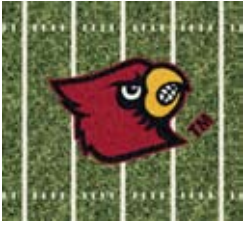
1150 Cards End Zone Color: Red