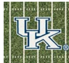
1140 Blue End Zone Color: Blue