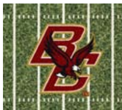
1043 Eagle End Zone Color: Red