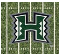
1105 Hawaii End Zone Color: Green