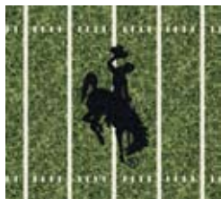
1491 Cowboys End Zone Color: Black