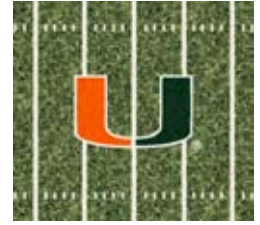
1157 Canes End Zone Color: Orange