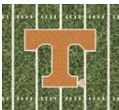
1400 Vols End Zone Color: Orange