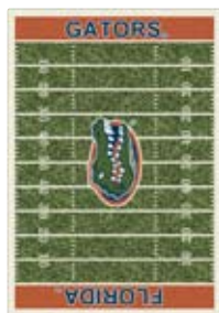
Size: 201 5'4" x 7'8"