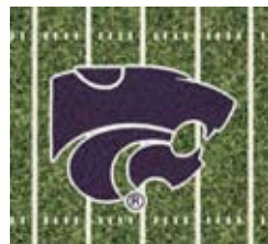
1125 Cats End Zone Color: Purple