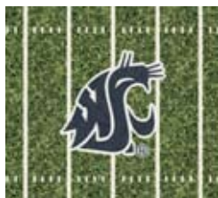
1466 WSU End Zone Color: Red