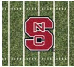
1220 State End Zone Color: Red